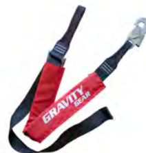
Work Positioning Lanyard