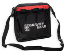
Adv. Tool Pouch