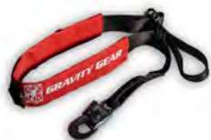
Work Positioning Lanyard