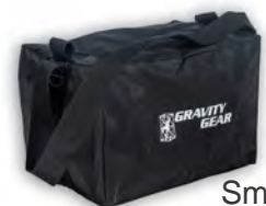
Small PPE Bag